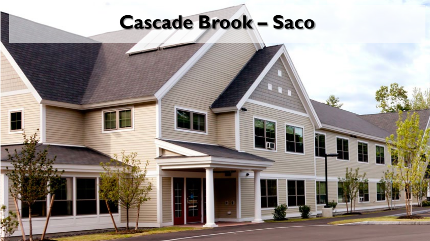
Cascade Brook – Saco