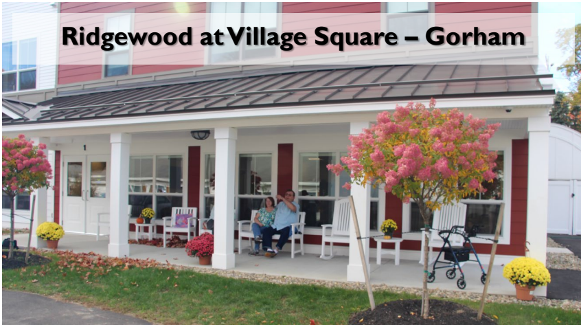
Ridgewood at Village Square – Gorham