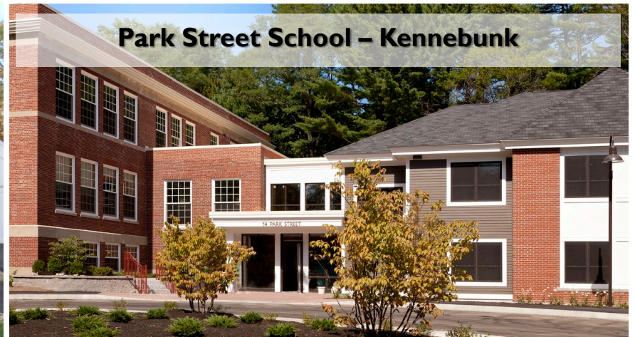
Park Street School – Kennebunk